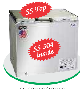
CF-330 SS/430 SS (Also available in Double Door CF-435 DD SS)