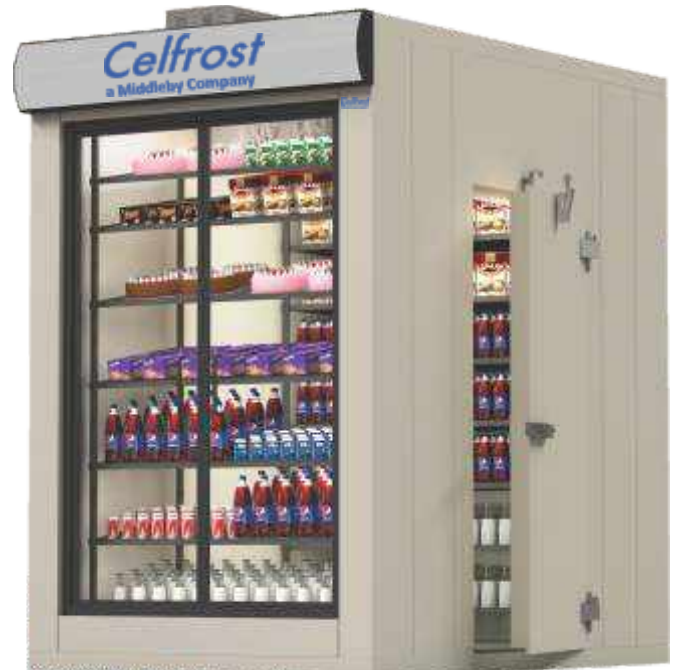
Display-cum Storage Coldroom