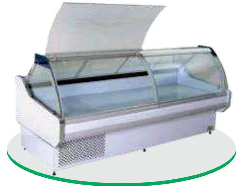
Plug-in & Remote