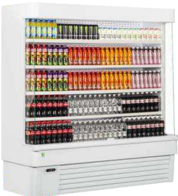
Remote Multideck Chiller (Close door option available in Chiller & Freezer)

Accessories optional, product image are for representation, actual product might vary.