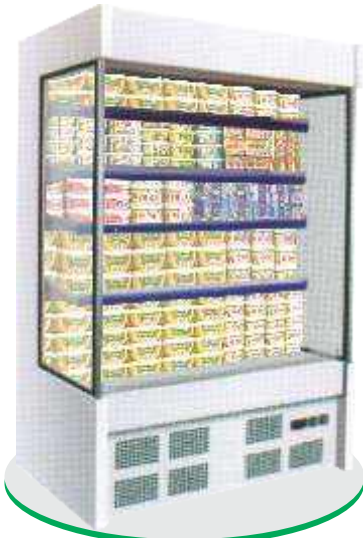
HTS 1000 / 1200 / 1500