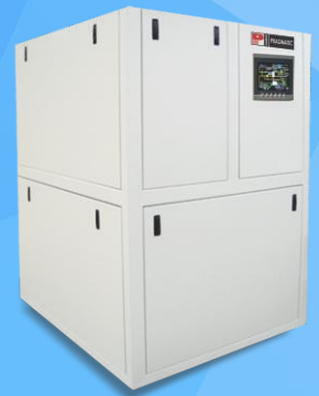
HEATING COOLING UNIT (FLUID CHILLER) (0.2kW to 15kW) for Labs and Pilot Plants as a complete utility package