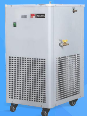
LOW TEMPERATURE FLUID CHILLER (500W to 200kW) Air Cooled and Water Cooled option available