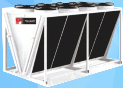
FLUID COOLERS (20kw to 200kw) With adiabatic Cooling