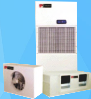
PACKAGED & DUCTABLE UNITS Air Cooled and Water Cooled High & Low Static Top and Bottom Discharges options are available