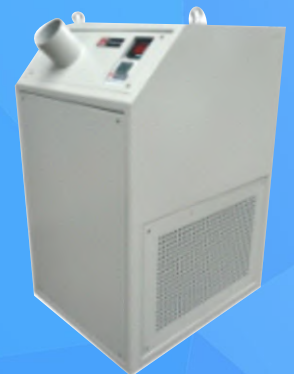
PORTABLE SPOT COOLER (1 TR-10 TR)