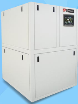
ULTRA LOW TEMPERATURE FLUID CHILLER (0.2 Kw - 20 Kw)