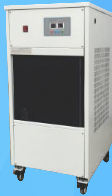
OIL CHILLERS (1TR To 30TR) Hydraulic Coolant or any other process oil cooling