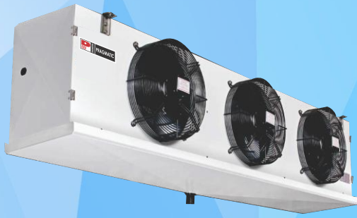
COLD ROOM EQUIPMENTS 0.5kW to 50kW