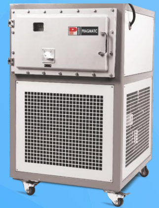
FLAME & EXPLOSION PROOF CHILLER (1TR-20TR) Air Cooled and Water Cooled option available