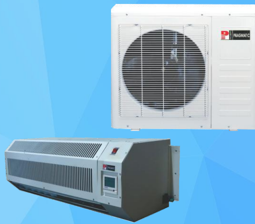
FLAME PROOF SPLIT AC UNIT (1.5 TR- 2 TR) Air Cooled and Water Cooled