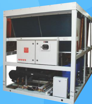
SCROLL CHILLERS (2TR-100TR ) Air Cooled and Water Cooled option available