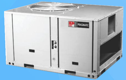
ROOF TOP & UNITARY PACKAGE UNITS (3 TR- 22 TR) Low and High Static Models