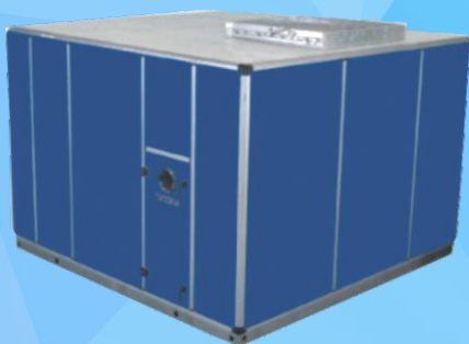
AIR HANDLING UNITS Single Skin and Double Skin Ceiling Suspended, Floor Mounting, Horizontal and Vertical options available