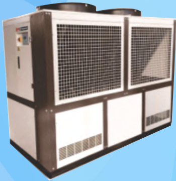
PORTABLE PROCESS CHILLERS (1 TR- 20 TR) Air Cooled and Water Cooled

Through the highly experienced Technical Team and Creative Customizing, we extend all sort of help to our clients in solving all their problems, in Engineering areas of our expertise which enables the clients to usually get number of additional features to maximize the value of their investments.