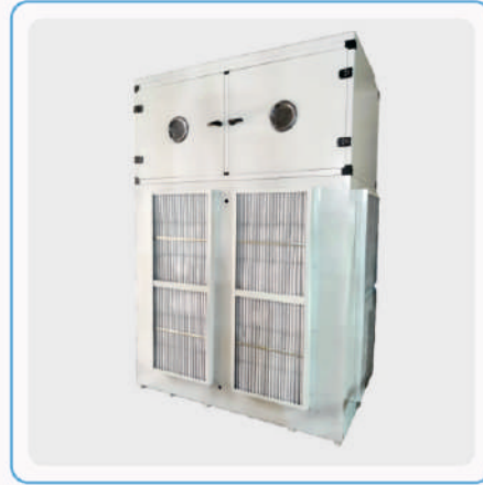
EC PLUG AWU-20000