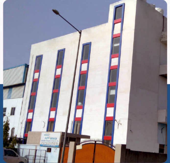
MANUFACTURING PLANT BAWAL (HARYANA)