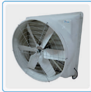
EXHAUST FAN (PP)