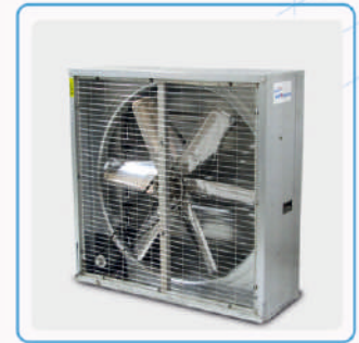
EXHAUST FAN (SS)