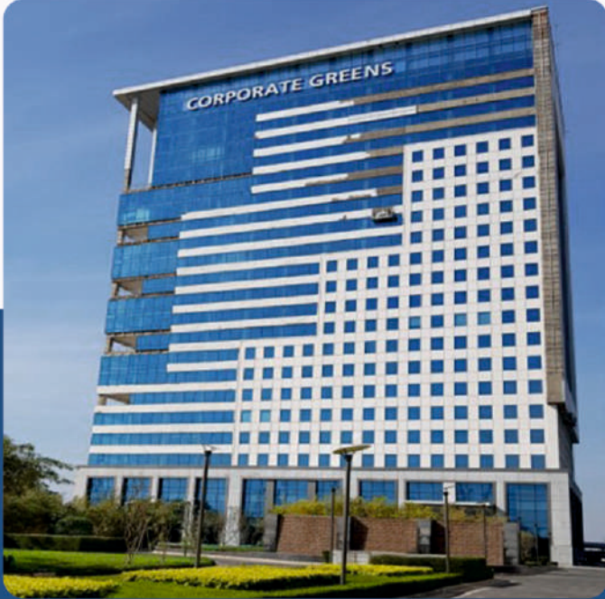
CORPORATE OFFICE DLF CORPORATE GREEN (GURGAON)