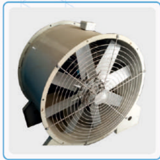
AXIAL FLOW FAN