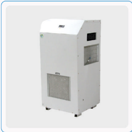
STAND ALONE UNIT