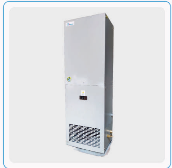
WATER COOLED UNIT