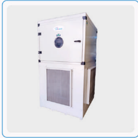
EC PLUG AWU-10000