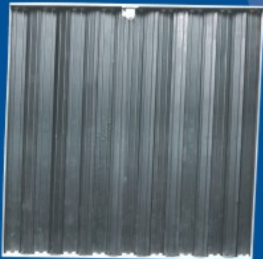
Aluminium Volume Control Damper