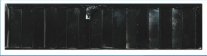
G.I. Volume Control Damper