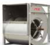
Forward Curved Series