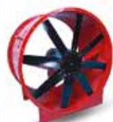
Tube Axial Flow Fan H - Class