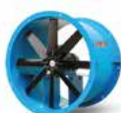
Tube Axial Flow Fan F - Class