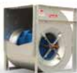
Backward Inclined Series