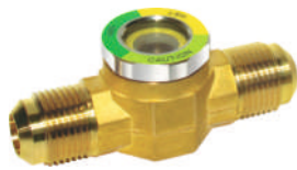
Moisture Indicator with Replaceable Element