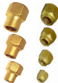
Forged Flare Nuts & fittings