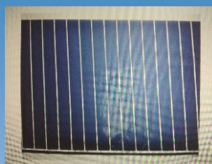
True image of segmented film(MPP)

New design (latest technology) capacitors use Pattern metallised Film where miniature fuses are incorporated during the metallisation process. This pattern metallised film is used in manufacture of capacitors leading to failure in open circuit only. This technology is such that one does not have to use costly raw material of S1 & S2 type capacitors & also this technology is more guaranteed to be safe than other designs.