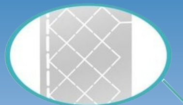
Pattern Film Segmented + T Margin