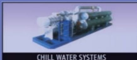
CHILL WATER SYSTEMS