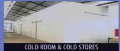
COLD ROOM & COLD STORES