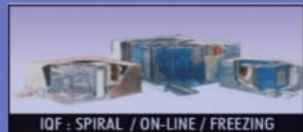
IQF : SPIRAL / ON-LINE / FREEZING